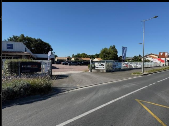
Delivery center – Meeting point for returns